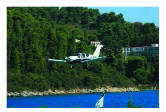
The Trinidad displays good manners on landing—our review of Trinidad accidents found only one rollout loss of control event.

The TB cockpit feels like being in a sports car. It is comfortable for long trips. I flew last summer from Durango to Baltimore with two fuel stops. The trip took 11 hours but was not particularly tiring. It was certainly more relaxing than driving for 11 hours! I love the two doors, especially with passengers who are not expert in getting into low-wing singles. However, the gullwing doors can easily fly up if they're not latched securely. This can be a big distraction on a takeoff roll, or, as once happened to me, when turning from crosswind to downwind.