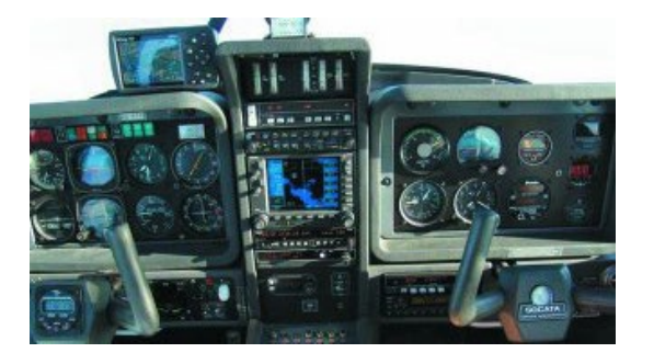
Modular panel has right-side gauges angled to face the pilot.

The Trinidad's control response is good, with the highest noticeable effort in roll. The ailerons aren't large and under airload, the push rods may pick up some