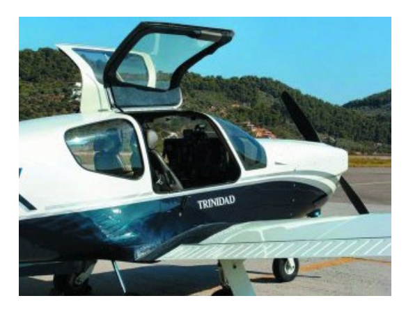
The door sill is higher than on a Piper or Beech, but the large opening helps ease boarding.

Annual inspections have averaged $3587, and have typically included some preventive maintenance and parts replacement to prevent failures—such