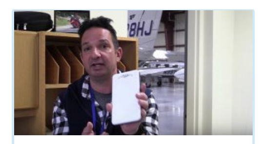
Flight Gear Battery Pack Trial

At the same time, the electrical system was changed from 14 to 28 volts. A change to a higher-speed starter motor followed. To its credit, the detail and systems changes Aerospatiale/ Socata has