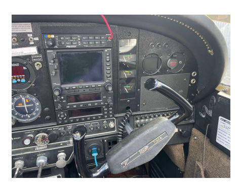
Specifications for this aircraft are believed to be accurate but are not warranted. It is the responsibility of the buyer to confirm all specifications, equipment, and times. AirMart does not represent or warrant the working order, merchantability, or operability of any equipment. Airplanes are dynamic assets whose condition, availability, and details may change without notice. All information is subject to independent verification and inspection by the buyer. Availability cannot be guaranteed, as the aircraft may be sold, leased, or withdrawn from the market at any time.