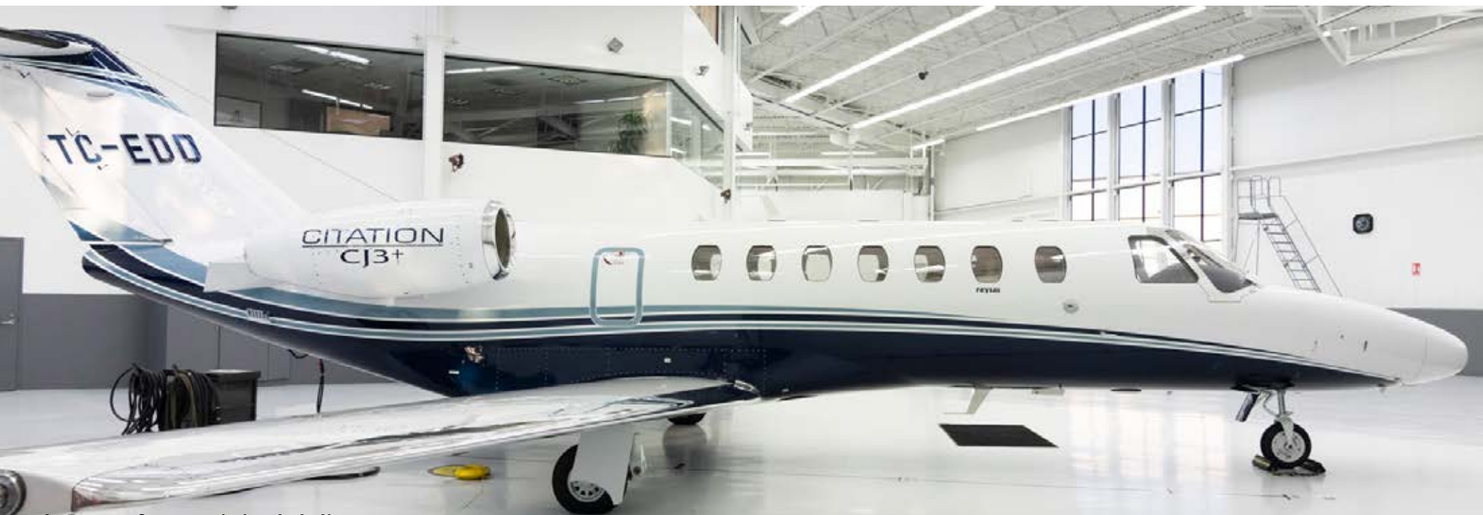
Images from original delivery